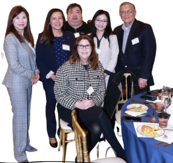
Alhambra Unified School District