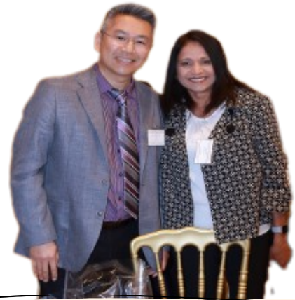
San Marino Unified School District