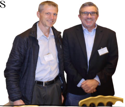
Fullerton Elementary School District