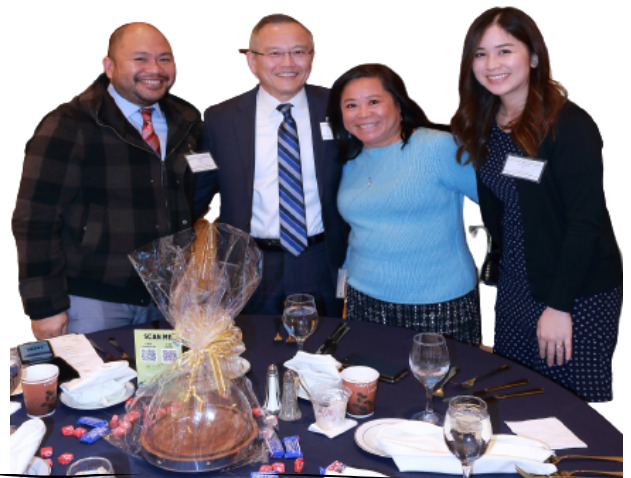
Garden Grove Unified School District