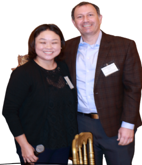
Glendale Unified School District