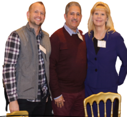
San Bernardino Unified School District