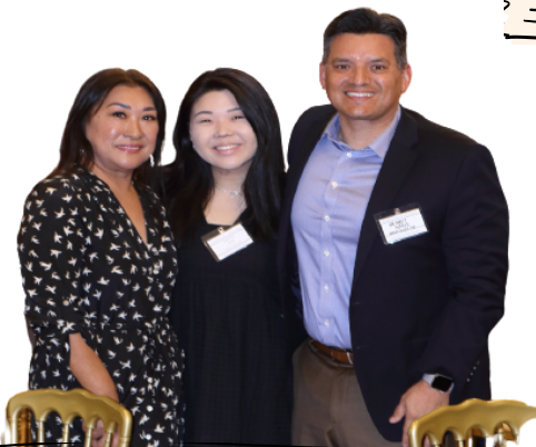
Walnut Unified School District