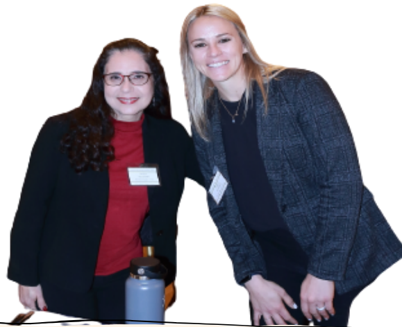
Huntington Beach City School District