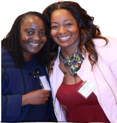
Azusa Unified School District