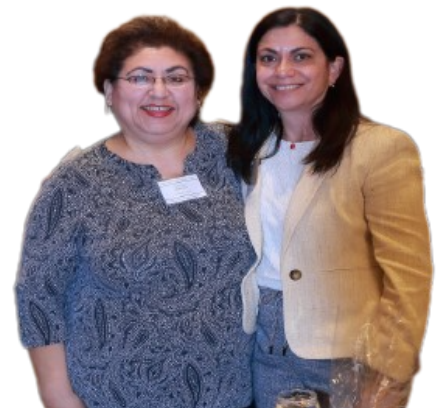
Whittier City School District