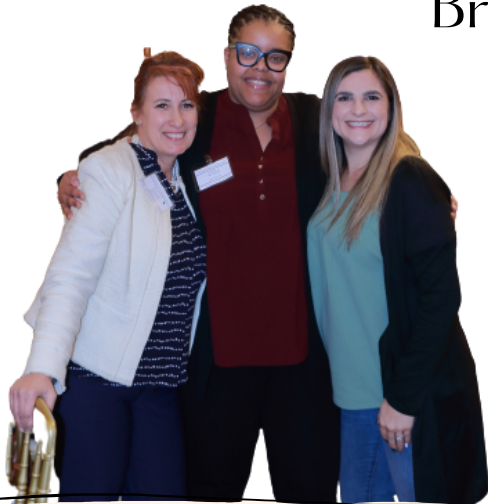
Redlands Unified School District