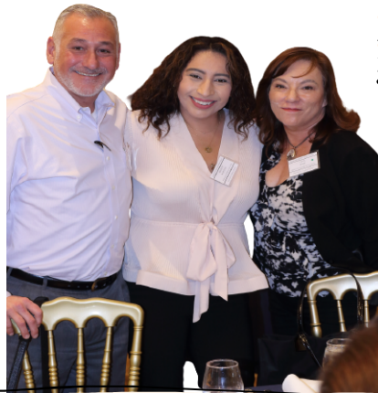
Dedicated Food Service Solution