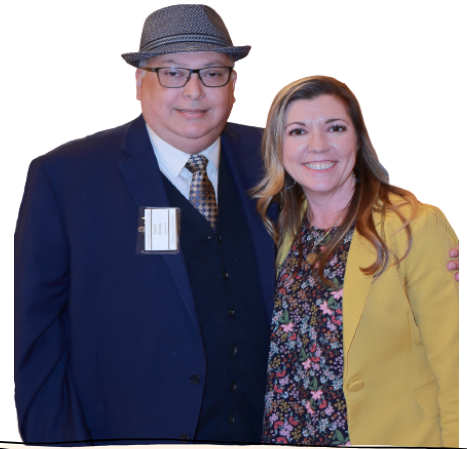
Orange Unified School District