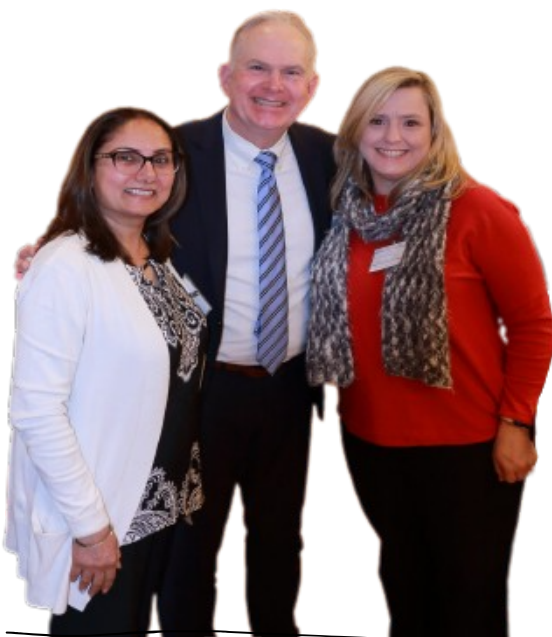
Ontario Unified School District